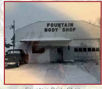
Fountain Body Shop

-We would then begin our walk home from the school. It seemed like it was always a nice white wintery day and walking through town you felt that Christmas spirit. Walking by the