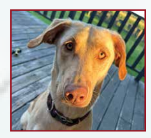
Family dog, Nellie