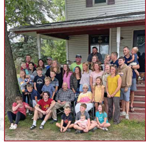
Family Group Photo

Growing up, we had a typical small farm. Dad milked cows until his back gave out and, despite what my older sisters might tell you, I did have to get up and help milk before school! In addition, we finished beef cattle and hogs in addition to growing mainly corn and soybeans.