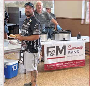
F & M serving food