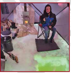
Cherrie's grandson ice fishing