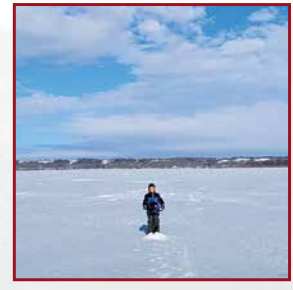
2023 Winter Lake