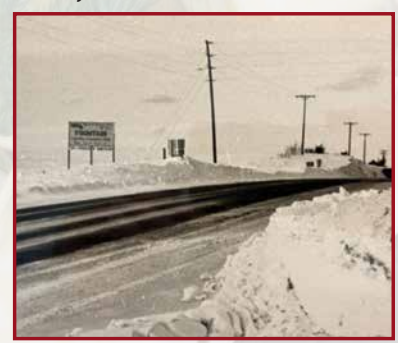
Winter in Fountain

I hope some of this reminds you of some memories of your own Christmases growing up and hope you have a holiday season filled with memorable moments you will cherish forever!