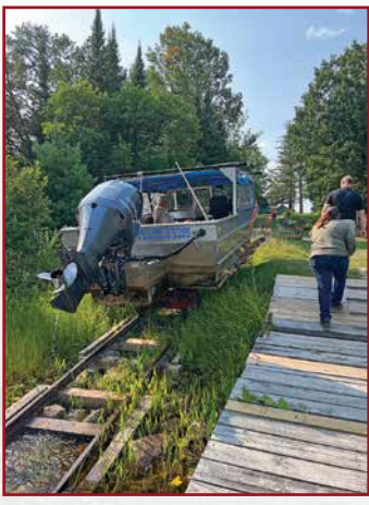
Portage used to get to the lake.