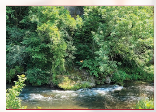
Root River Trail - Preston