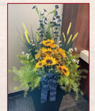
Enjoy the summer!

Stop in the Chatfield branch any time to say hi! Hopefully we have more [makes] opportunities to see you out and about in town as this weather gets better. Western Days will be here before we know it!