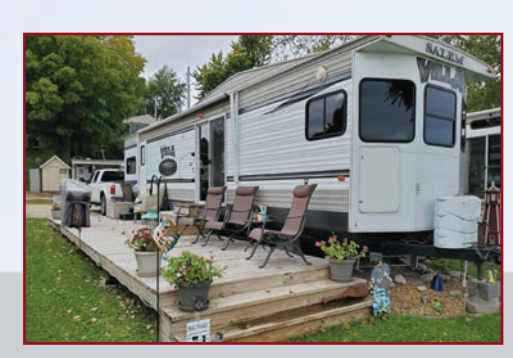
Home away from home

If I could turn any activity into an Olympic sport, I would have a good chance at winning a medal for camping