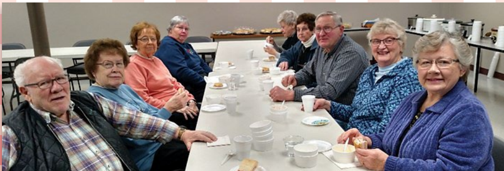
Our expert panel of Cook-Off Taste-Testers in Preston

Add all the ingredients together in a crockpot until warm and enjoy!