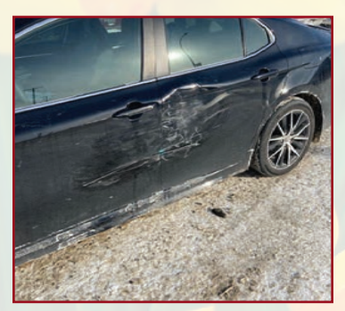
Damaged Toyota Camry

Now being crunched for time (pardon the pun), I back out of the garage a little faster than usual and suddenly there is a BANG! I backed into my son's brand-new Toyota Camry! I could not believe anything was back there for me to hit! I immediately knew this was going to be a body shop issue and jump out of the car and check the damage inflicted to