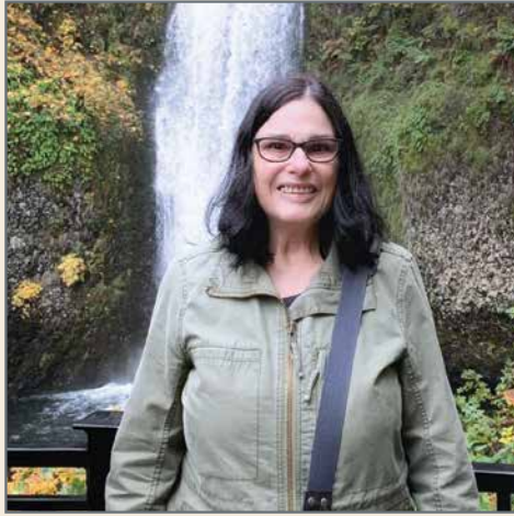
Picture was taken last October at Multnomah Falls in the Columbia River Gorge in Oregon.

After 40-Years of Service, Here's What Retirement Looks Like: