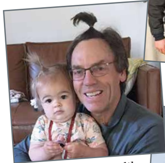
Like granddaughter, like grandfather - when we couldn't get haircuts. 😊